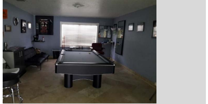
(BEFORE) Original Condition