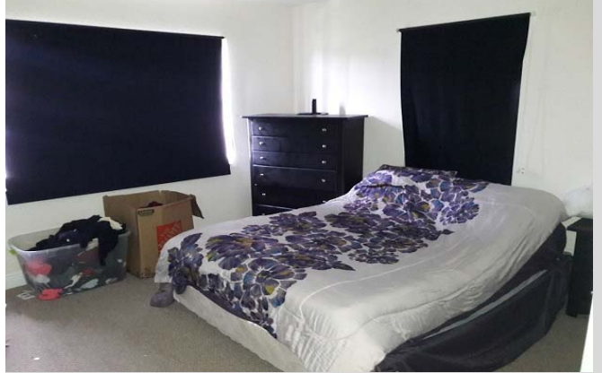
Remove all Bedroom Carpet