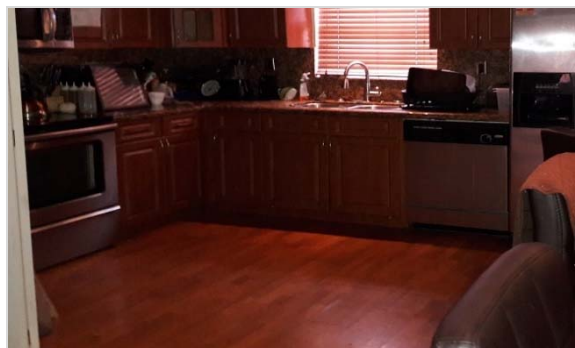
Remove Wood Floor Kitchen