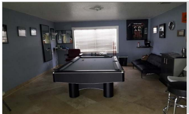
Remove Tiles Family Room